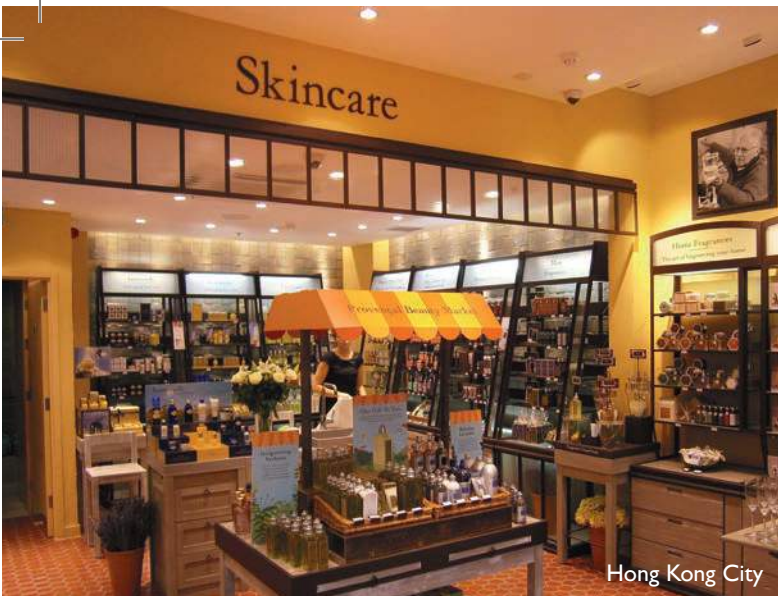
Hong Kong City