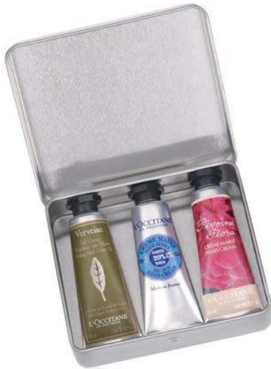
HAPPY HAND TRIO Verbena hand cream 10ml, shea hand cream 10ml, peony flora hand cream 10ml.

Thanks to these pretty tins, offer your guests the traditional essences of L'OCCITANE.