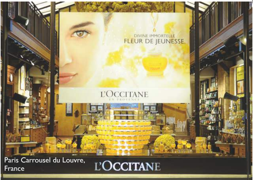
Paris Carrousel du Louvre, France