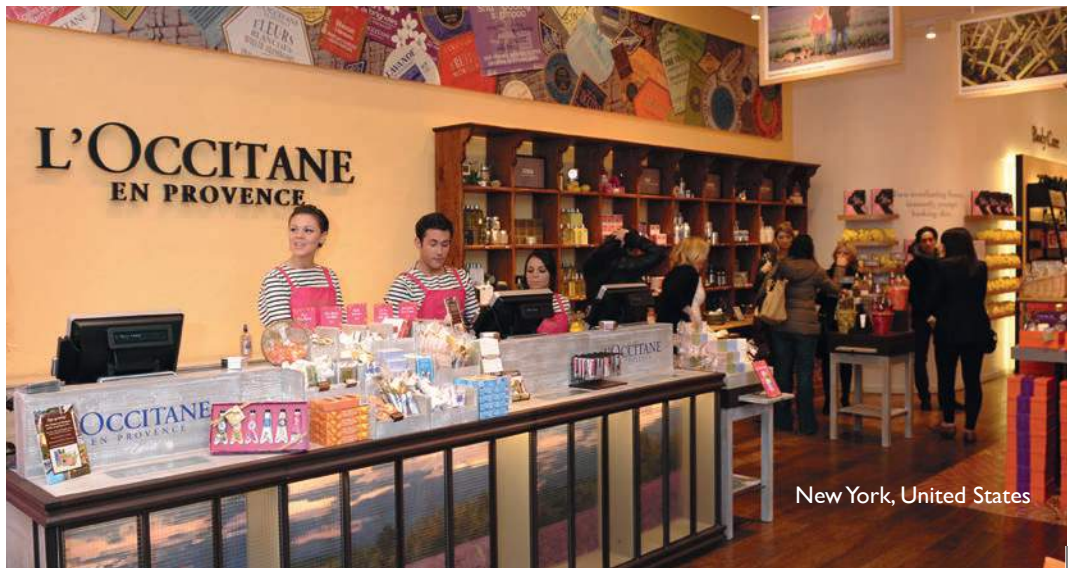
New York, United States