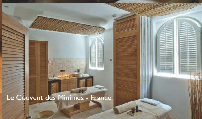
Le Couvent des Minimes - France