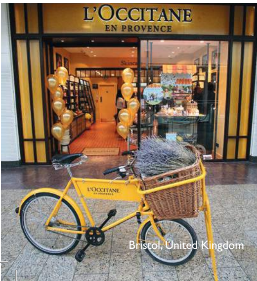
Bristol, United Kingdom