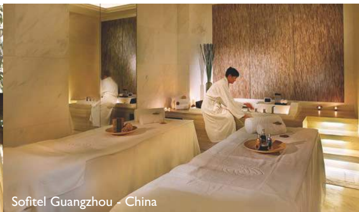
Sofitel Guangzhou - China