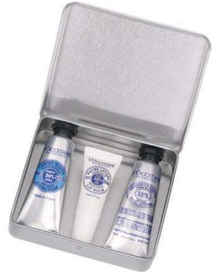
FACE FAVORITES TRIO shea hand cream 10ml, shea lip balm 3ml, ultra rich face cream 10ml.