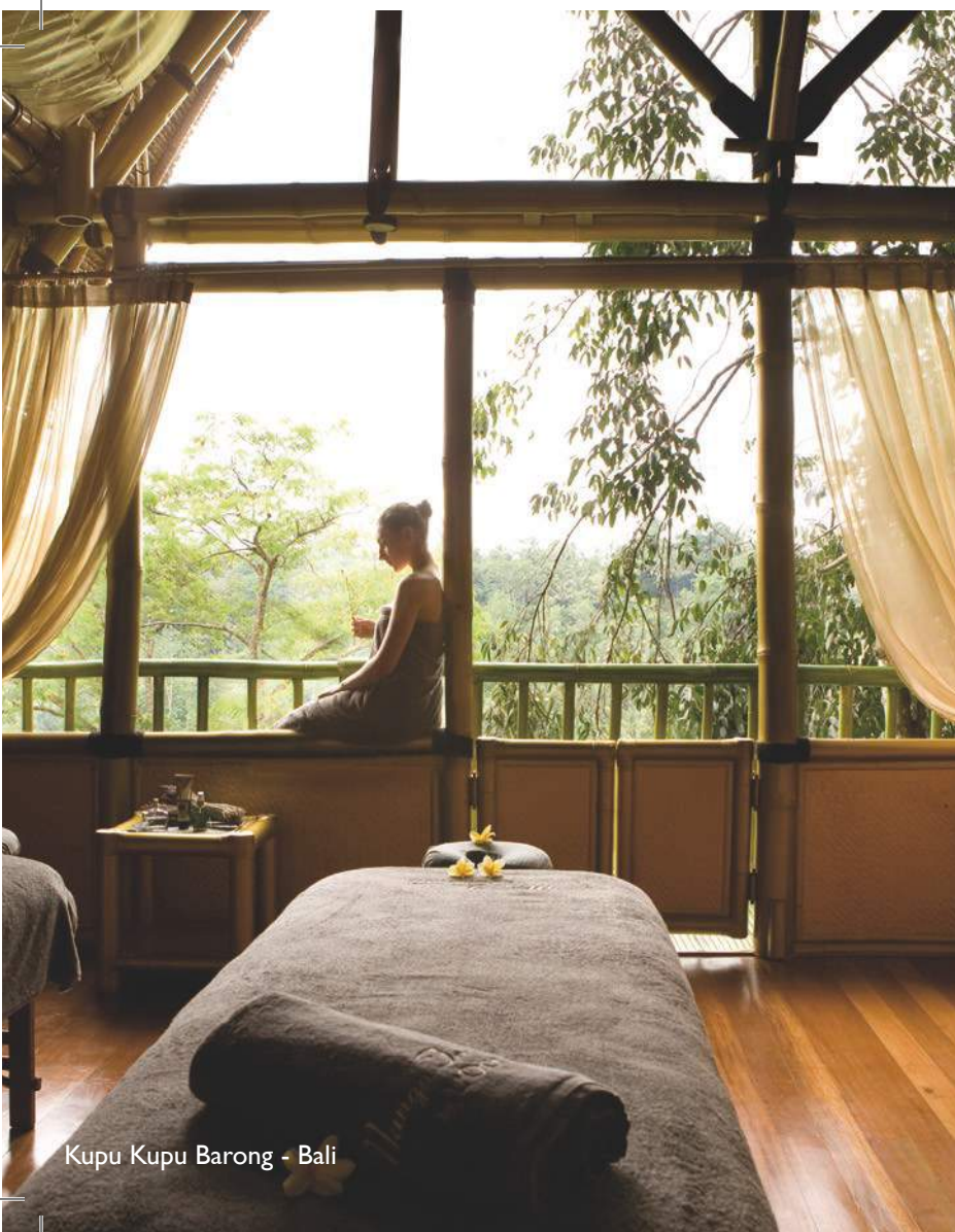
Kupu Kupu Barong - Bali