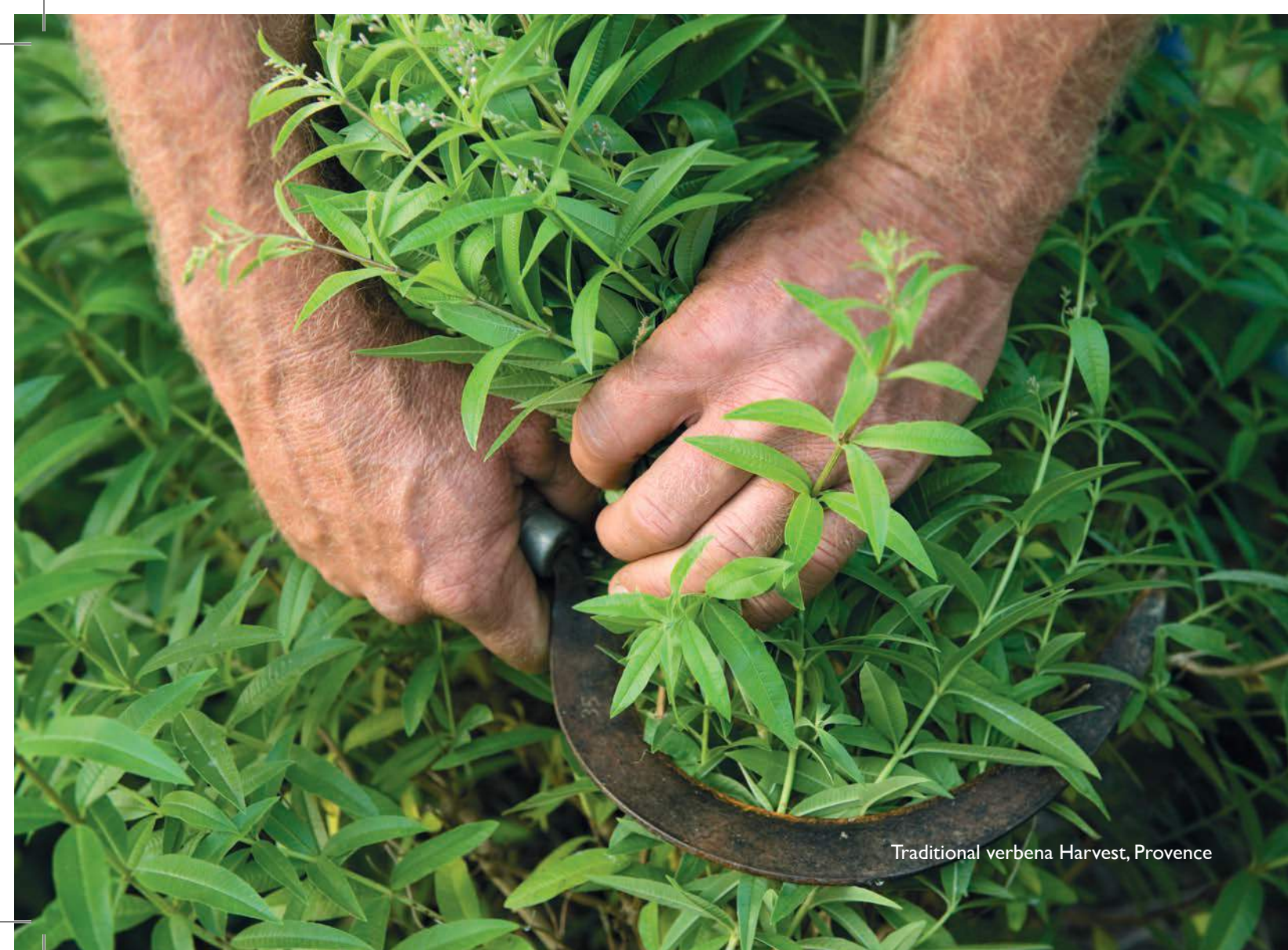
Traditional verbena Harvest, Provence