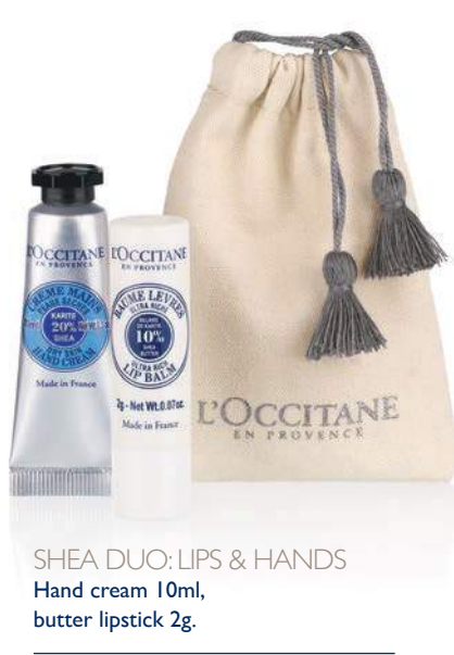
SHEA DUO: LIPS & HANDS Hand cream 10ml, butter lipstick 2g.

These tiny pouches hold all the power of Shea: protecting, nourishing and moisturizing.