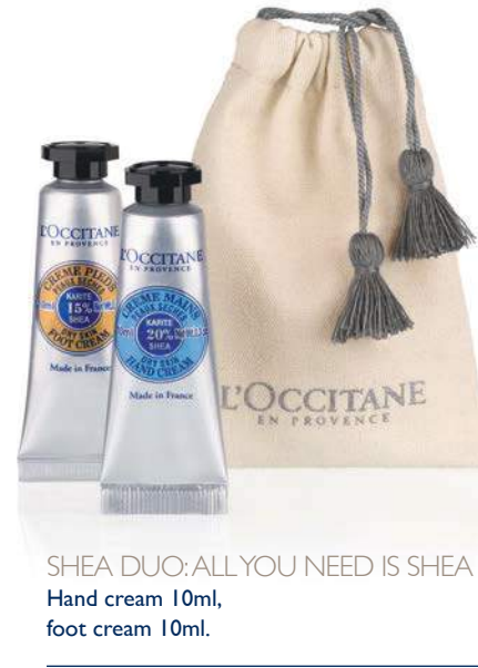
SHEA DUO: ALL YOU NEED IS SHEA Hand cream 10ml, foot cream 10ml.