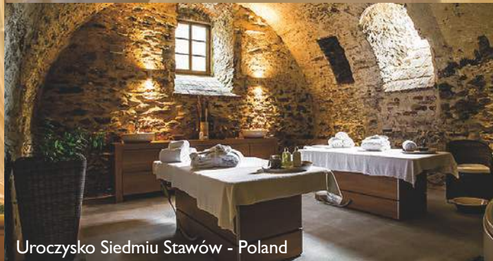
Uroczysko Siedmiu Stawów - Poland